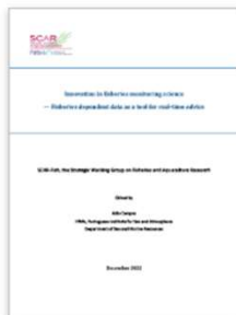
Innovation in fisheries monitoring science - Fisheries dependent data as a tool for real-time advice - December 2022