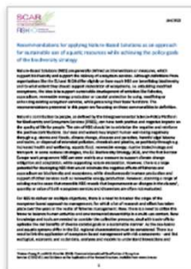
Recommendations for applying Nature-Based Solutions as an approach for sustainable use of aquatic resources while achieving the policy goals of the biodiversity strategy - January 2022