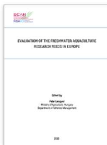
EVALUATION OF THE FRESHWATER AQUACULTURE RESEARCH NEEDS IN EUROPE - January, 2020