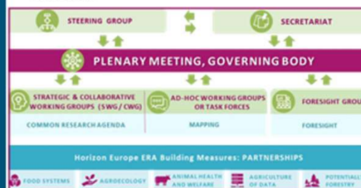
Figure 4: SCAR organisation and structure

The structure of SCAR is visible in Figure 4. The Plenary, SCAR's governing body, is supported by the Steering Group and by the Secretariat, which is held by DG RTD and supported by DG AGRI, who chairs the Plenary meetings supported by the SCAR delegate from the country which is temporarily in charge of the rotating presidency of the Council of the EU. The various groups active under the SCAR umbrella are gathered according to their type. There are Strategic Working Groups (SWGs), Collaborative Working Groups (CWGs), any Ad-Hoc Working Groups or Task Forces (TFs) and the SCAR Foresight Group – from now onwards (when referenced in general) referred to as SCAR Groups .