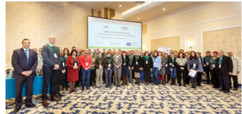
Figure 10: SCAR National Meeting 2018 - Bulgaria, Sofia