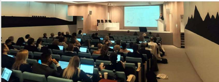
Figure 12: SCAR CONFERENCE 2022 - Paris, France