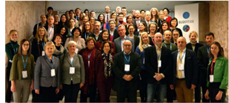
Figure 9: SCAR Conference 2017- Tallinn - ESTONIA