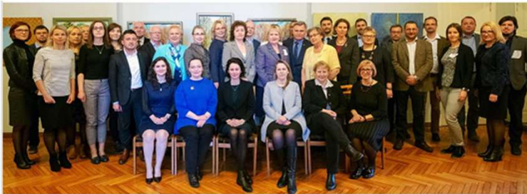
Figure 11: Baltic workshop on SCAR and Bioeconomy Strategies 2019 - Latvia, Riga