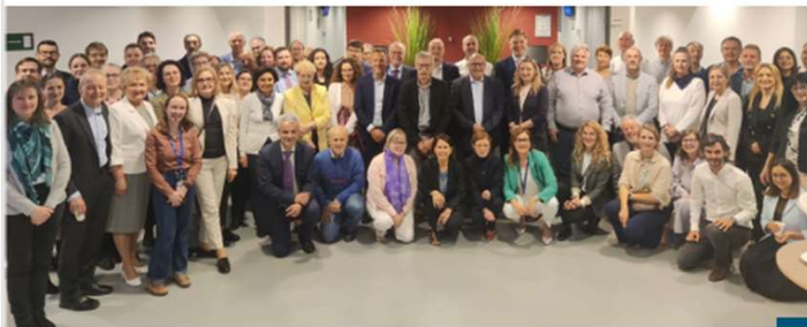
Figure 13: SCAR Plenary 2024 - Belgium, Brussels